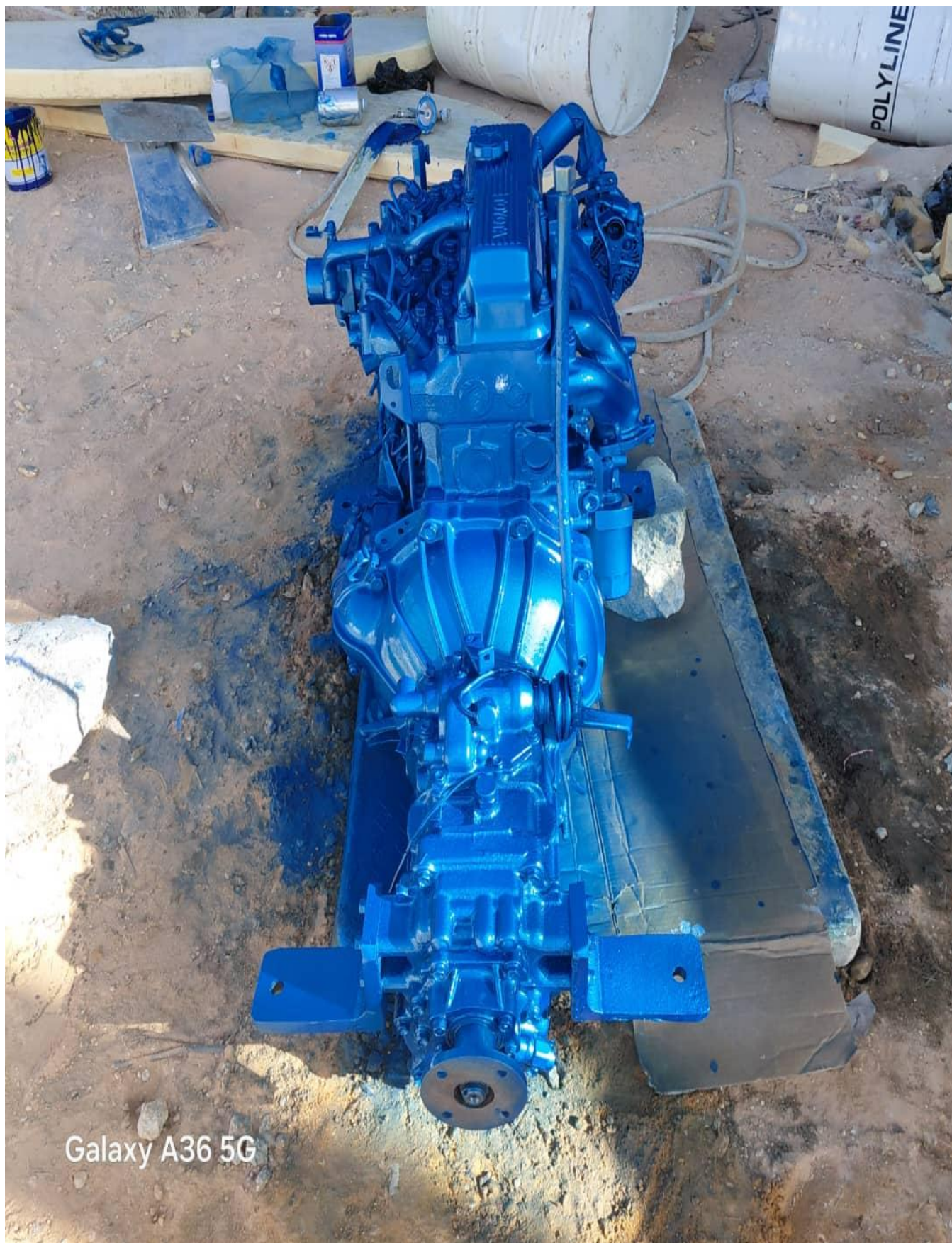
Galaxy A36 5G